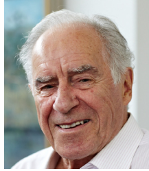
Playwright // Alan Hopgood