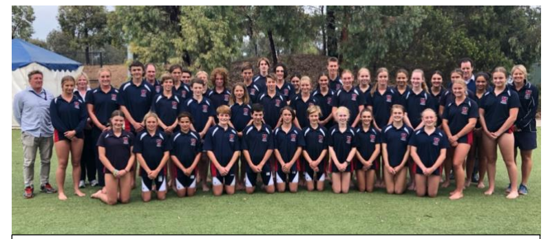
HOUSE SWIMMING CARNIVAL SPECIAL EDITION

MONDAY 22 – 26 FEBRUARY 2021 – The ultimate sport news bulletin for Saint Ignatius College